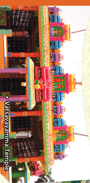
• Vatsavayamma Temple

• Sri Lakshmi Tirupatamma Temple Penuganchiprolu